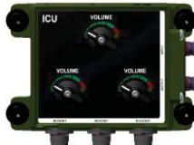
VICM 205 Intercom Communication Unit (ICU)

Three (ANR) crew members can be connected to the ICU with access to the intercom. Crew members connected to the ICU can also monitor CNRs.