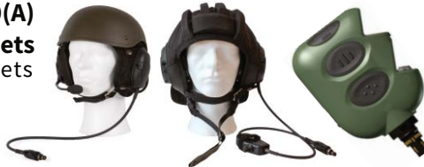
VICM 209 Personal Communication Interface (PCI)

A broad range of personal headsets is supported, including ANR, TTC etc.