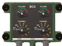
VICM 202 Basic Communication Unit (BCU)

Two (ANR) headsets can be connected to this unit, providing full access to the intercom and CNRs, with independent volume control for crew members.