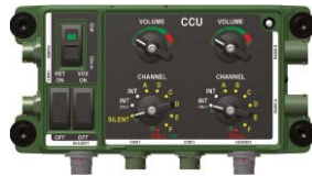
VICM 201 Central Communication Unit (CCU)

Two (ANR) headsets with full access to the intercom; CNRs can also be connected to the CCU. The unit is designed to connect two senior crew members with two top-priority, galvanically isolated CNRs.