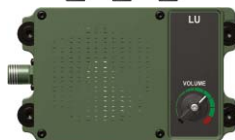
VICM 207 Loudspeaker Unit (LU)

Rugged loudspeaker for loud reproduction of the intercom, CNR and warning signals.