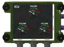
VICM 205 Intercom Communication Unit (ICU)

Three (ANR) crew members can be connected to the ICU with access to the intercom. Crew members connected to the ICU can also monitor CNRs.