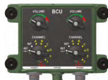
VICM 202 Basic Communication Unit (BCU)

Two (ANR) headsets can be connected to this unit, providing full access to the intercom and CNRs, with independent volume control for crew members.