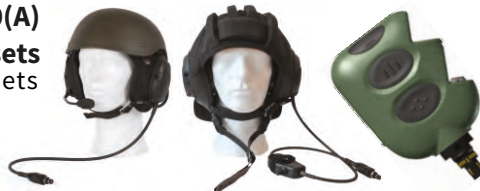
VICM 209 Personal Communication Interface (PCI)

A broad range of personal headsets is supported, including ANR, TTC etc.