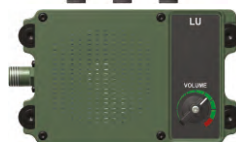
VICM 207 Loudspeaker Unit (LU)

Rugged loudspeaker for loud reproduction of the intercom, CNR and warning signals.