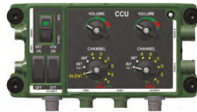
VICM 201 Central Communication Unit (CCU)

Two (ANR) headsets with full access to the intercom; CNRs can also be connected to the CCU. The unit is designed to connect two senior crew members with two top-priority, galvanically isolated CNRs.